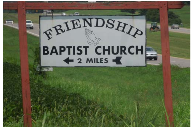
Friendship Church Sign