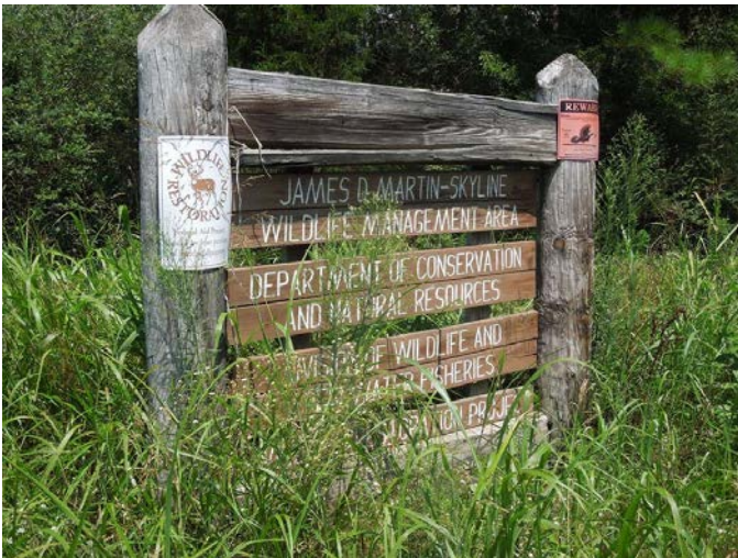
Phillip Hamman Land