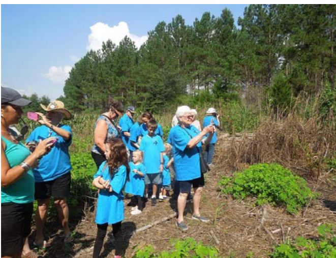
Phillip Hamman Land