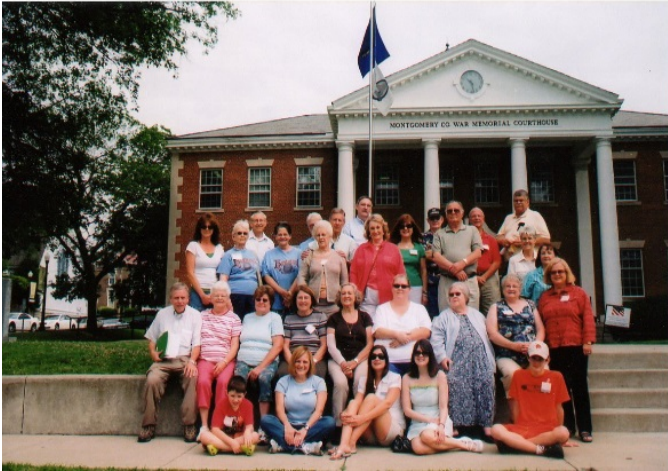
Montgomery County Courthouse, 2008 Reunion in Lexington, KY