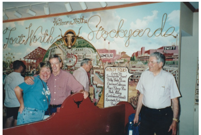
Ft. Worth Stockyards at 2002 Reunion in Dallas, TX