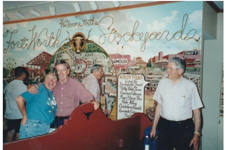
Ft. Worth Stockyards at 2002 Reunion in Dallas, TX